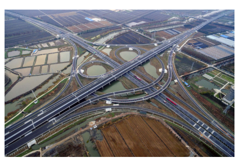
Expressways cross farmlands in Taizhou, east China's Jiangsu Province

Xi's proposal to build a "community with a shared future for mankind" seeks to strengthen multilateralism to address global and regional imbalances. It is believed that development on a wider scale could generate new impetus for inclusive global growth. According to the World Map of Economic Growth produced by the Center for International Development at Harvard University, the countries with the biggest potential for growth in the coming decade are mostly in South Asia and East Africa. Others in South America and the Middle East are also poised to take off. Meanwhile, growth will slow in advanced economies. The United States is expected to grow at 2.58 percent per year and Britain slightly faster at 3.22 percent, while Germany, one of the leading economies in Europe, will grow at just 0.35