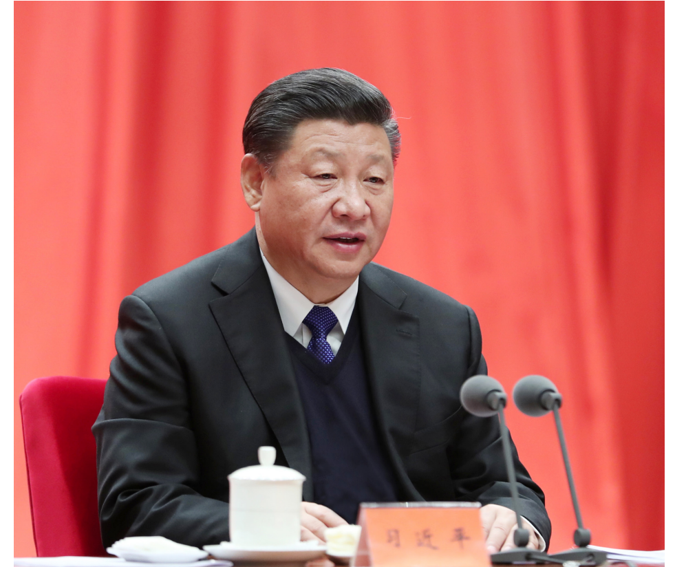
Xi Jinping, General Secretary of Central Committee of the Communist Party of China and President of People's Republic of China, delivers a speech at the second plenary session of the 19th CPC Central Commission for Discipline Inspection on January 11

hina's anti-graft campaign has made remarkable progress since the 18th National Congress of the Communist Party of China (CPC) in late 2012, and yet the battle is far from over. This was the message announced loud and clear at the latest session of the CPC's anti-corruption body.