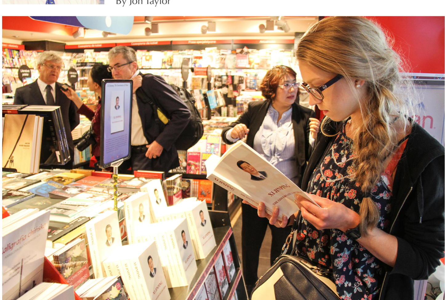
Global circulation of Xi Jinping: The Governance of China (Volume II) has exceeded 10 million by January 12 (XINHUA)

little over three years ago, the State Council Information Office of China, the Party Literature Research Office of the Communist Party of China (CPC) Central Committee and the China International Publishing Group (CIPG) edited and published Xi Jinping: The Governance of China. The book received notable attention both in Xi Jinping: The Governance of China (Volume II) follows up on