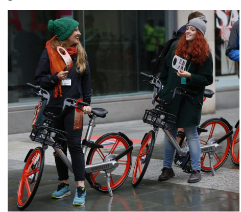
Locals ride bicycles operated by Mobike, a Chinese bike-sharing company, in Manchester, United

bridges, ports, gas pipelines, power grids and fiber-optic cables. To facilitate inclusive growth, it is critical not only to deploy means of production, but also means of delivery and access to information. And one can envision that some of today's low-income countrieshaving heeded the popular refrain, "Want to get rich? Build roads first!"-may one day tell growth stories that mirror China's.