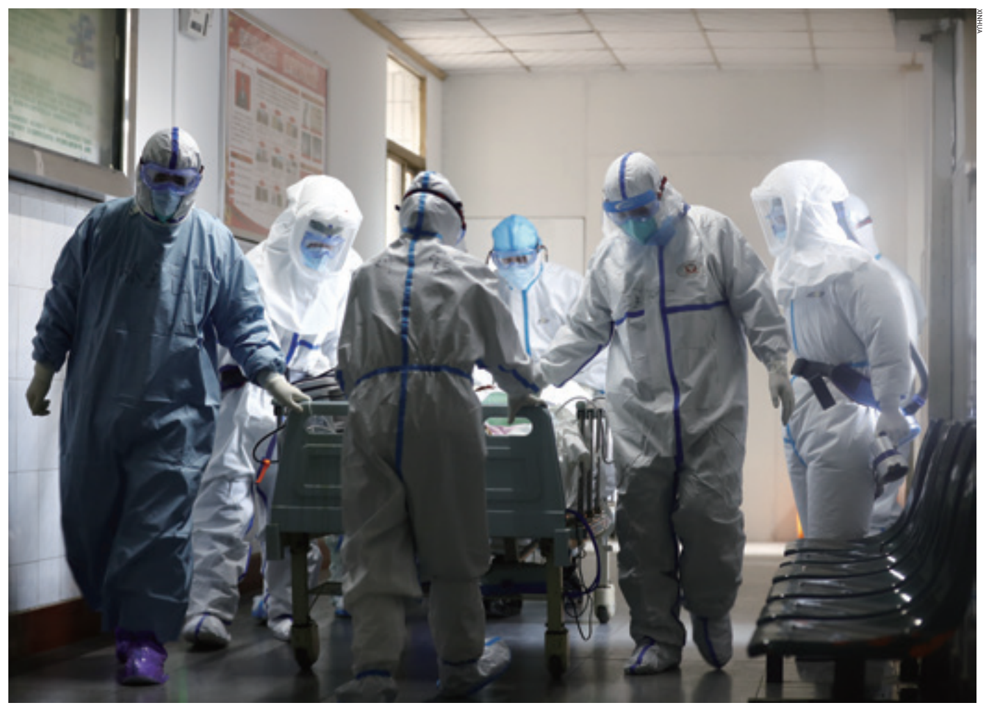
Medical workers transfer a patient to the intensive care unit in a hospital in Wuhan, Hubei Province in central China, on February 17