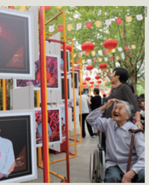
Seniors visit a photo exhibition of more than 30 golden wedding couples at a park in Minhang District in Shanghai on October 7, 2019

At the same time, the regulators need to address the market's problems. They need to clarify accommodation, catering, shopping and medical service details in silver tourism, and the traveling market standards must be regulated to provide a healthy consumption environment for senior travelers so that they can enjoy their old age better.