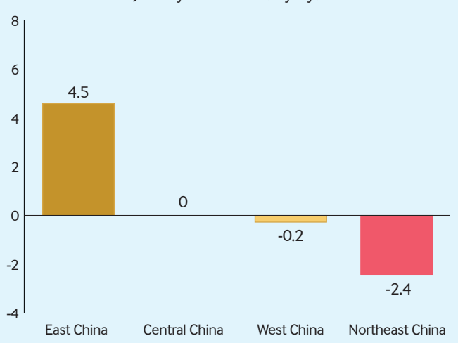
January-November (% y.o.y.)