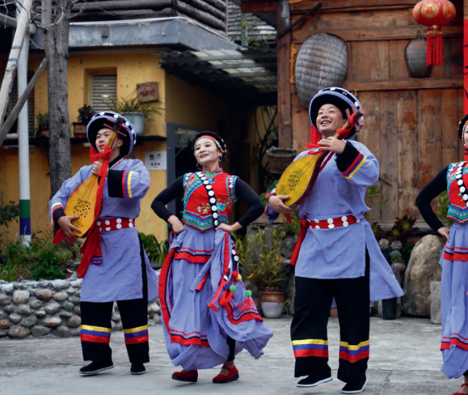
Local residents dressed in traditional ethnic attire perform folk songs and dances at a village in Nujiang Lisu Autonomous Prefecture, Yunnan Province, on March 28