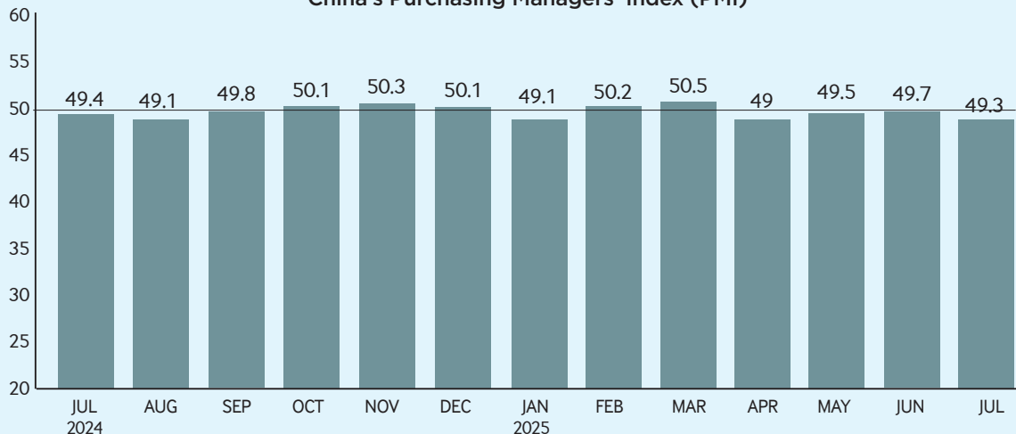
China's Purchasing Managers' Index (PMI)