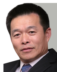
Dean, Institute for Contemporary China Studies, Tsinghua University