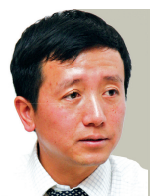
Researcher, Chinese Academy of International Trade and Economic Cooperation