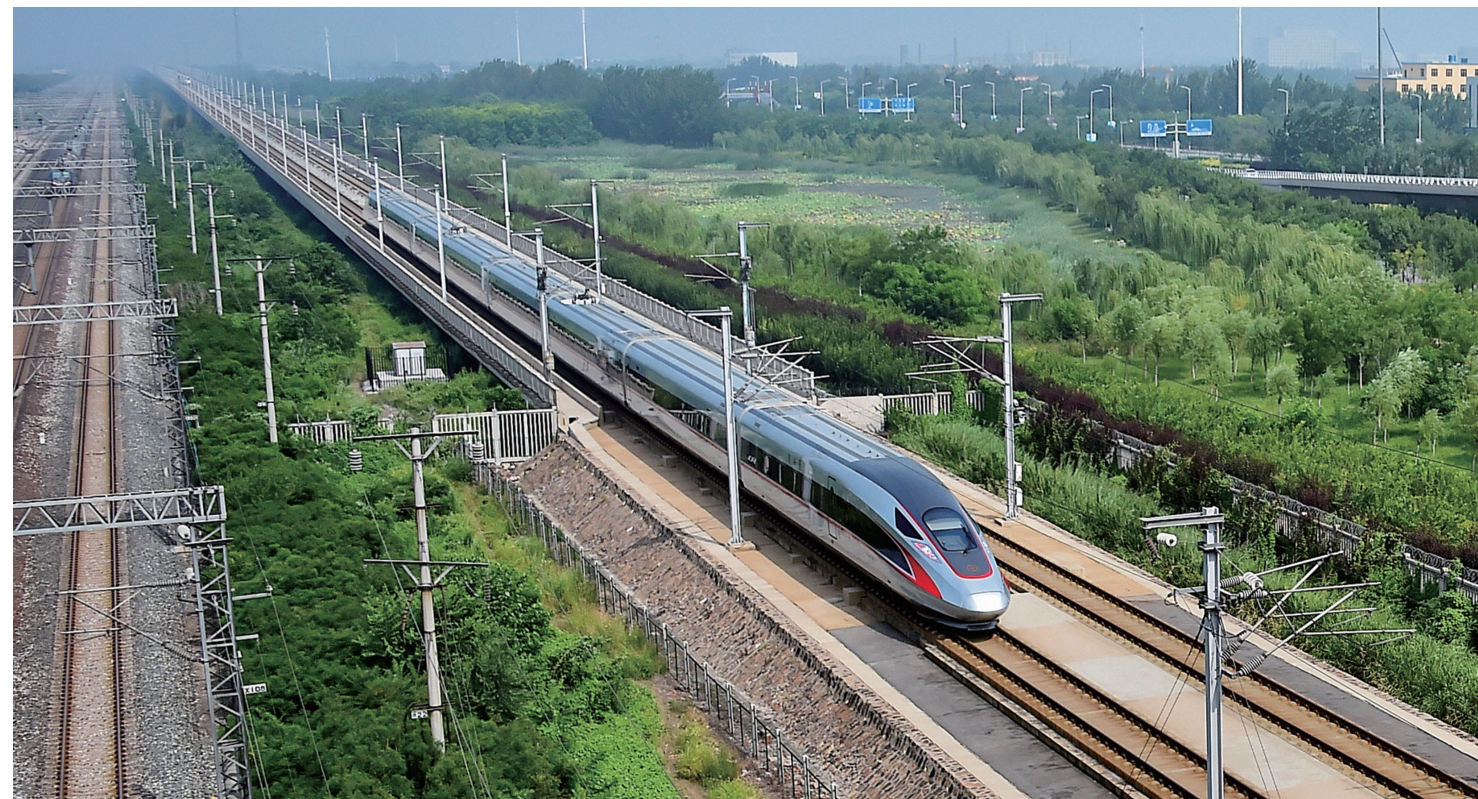
A bullet train travels along the Beijing-Tianjin intercity high-speed railway on August 31

Scan QR code to visit Beijing Review’s website Comments to yushujun@bjreview.com